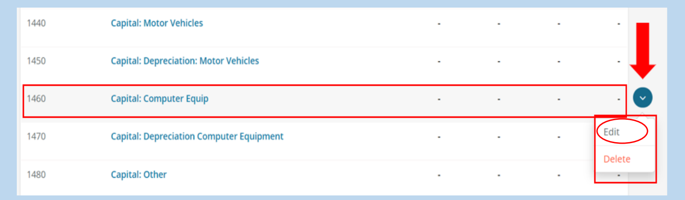
Table C - First account to be renamed 1460 Capital: Computer Equipment